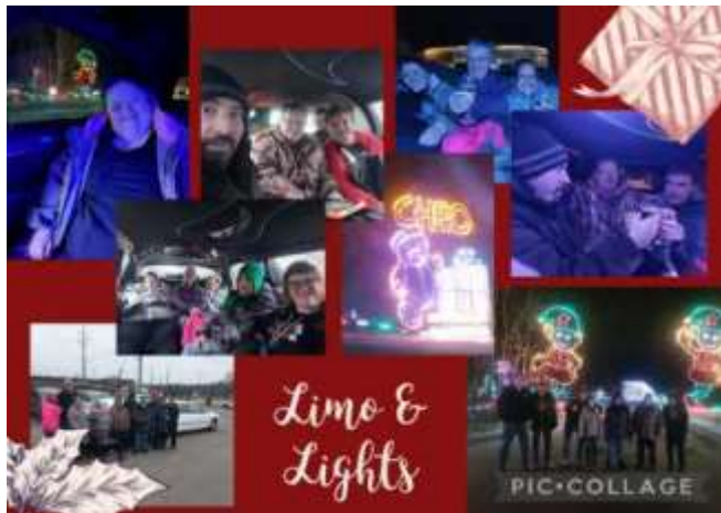
Magic of Lights at Wesley Clover Park AND a Limo Drive!!