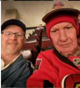
We may have a few Ottawa Senators fans! Lots of fun at the hockey games!!