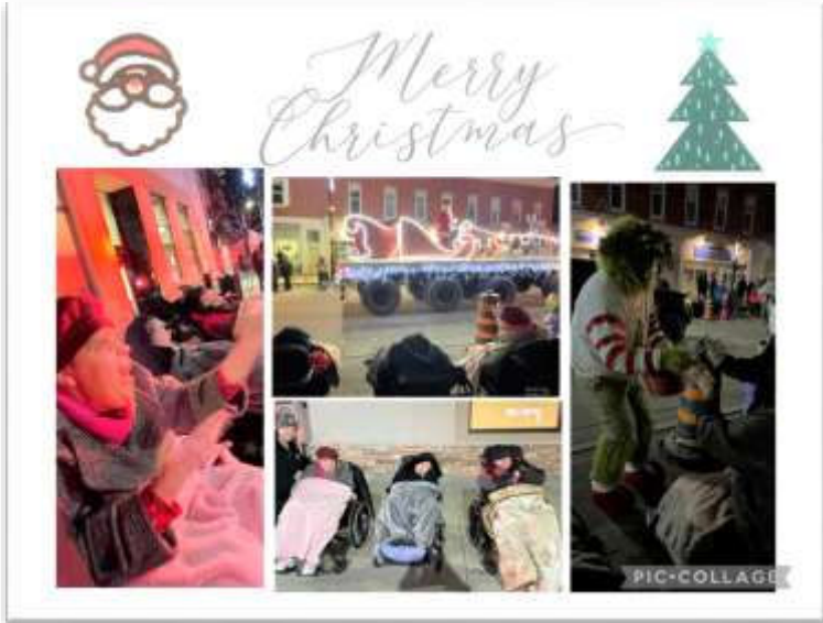
Arnprior and Renfrew Christmas Parades! It was very cold but everyone had a great time!